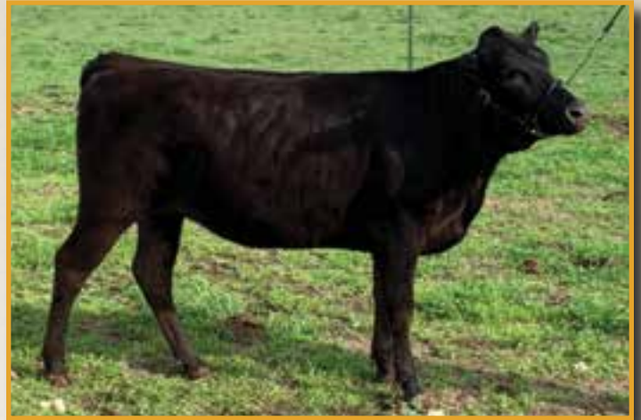
TUR ITOMICHI SHIG 81F • SELLS AS LOT 19.

This heifer competed in the Houston Livestock Show this year and received 3rd place. This heifer has a great pedigree. On the sire side, this includes Shigeshigetani, Michifuku, Suzutani, Haruki 2, and Fukutsuru. Shigeshigetani has some of the most powerful genetics in the Wagyu breed blended together in one impressive pedigree. This pedigree shows true in this heifer, with an ultrasound marbling score of 6.83 at 18 months she is on her way to the same results. On the dam side TF Itomichi 1/2, Takazakura and Fukutsuru. TF Itomichi 1/2 genetics are widely used for producing consistently large quality carcasses, increased milking abilities, mature size and growth rate without reducing marbling. Pasture exposed to MG Kitaguni 7114E bull (FB33383) from 12/01/2019 to 1/31/2020 and confirmed bred by veterinarian palpation. This bull is a son of World K's Kitaguni Jr. with TF Itomichi 1/2 and World K's Michifuku on the dam side. This heifer is located in the Texas Hill Country with several shipping options available.