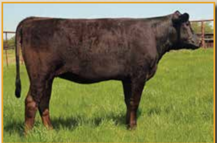
M6 MS MICHİYOSHI 8138F • SELLS AS LOT 44.