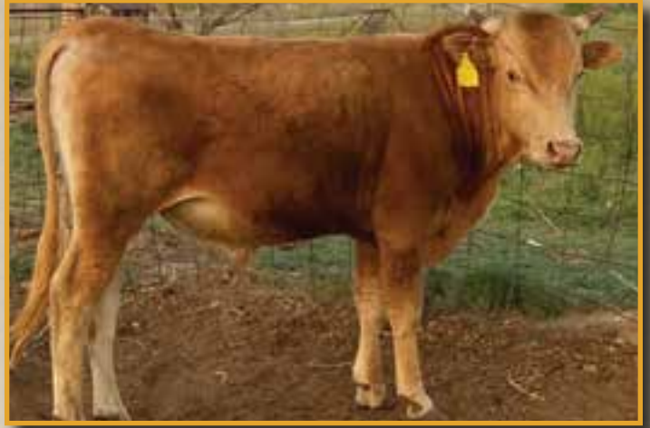
SELLS AS LOT 64.