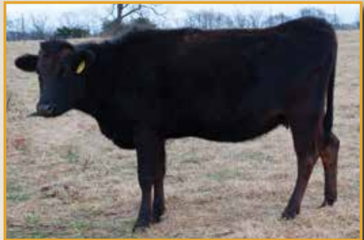
ROWE 151X 068 • DAM OF LOT 209.