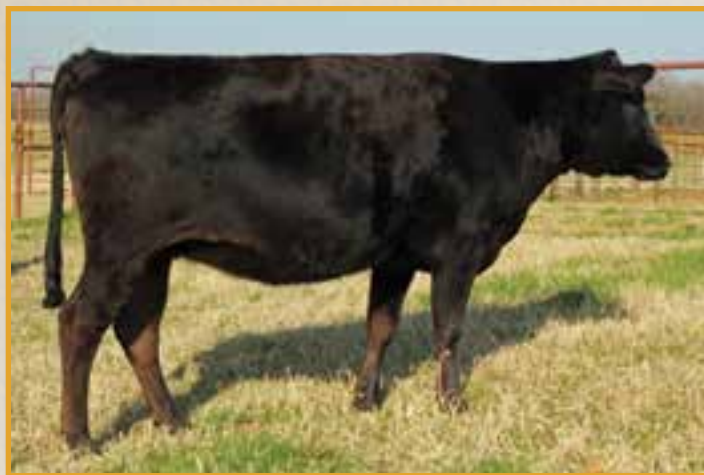
PL PRIMELINE MS TOSHITA C066 • DAM OF LOT 56.