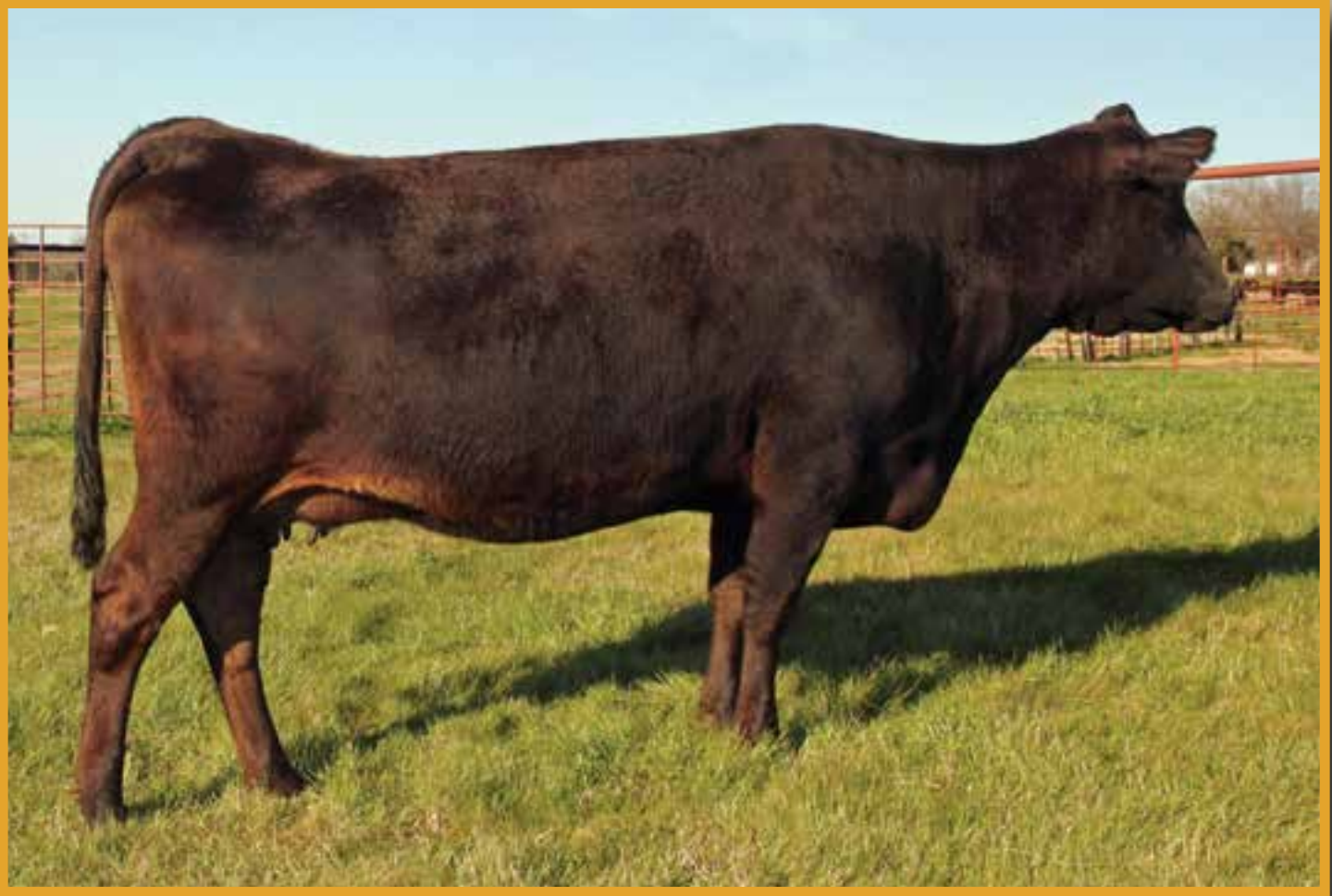
PRIMELINE MS MICHITO Y09 • SELLS AS LOT 3.