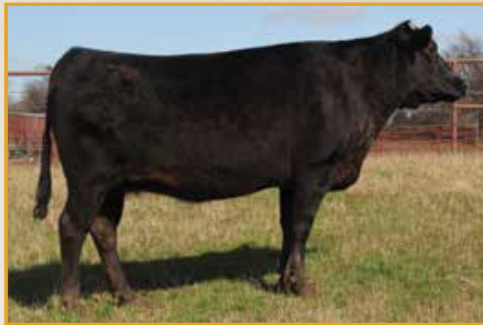
LMR MS TAK 1K 759T • DAM OF LOT 43.