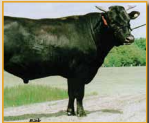
WORLD K'S HARUKI 2

SIRE MONJIRO 11550 YASUMI DOI HARUMI 1086409 DAM SAKURA 2 741638 KENSHIN 902 ITOHOME 3 5459878 VA/3