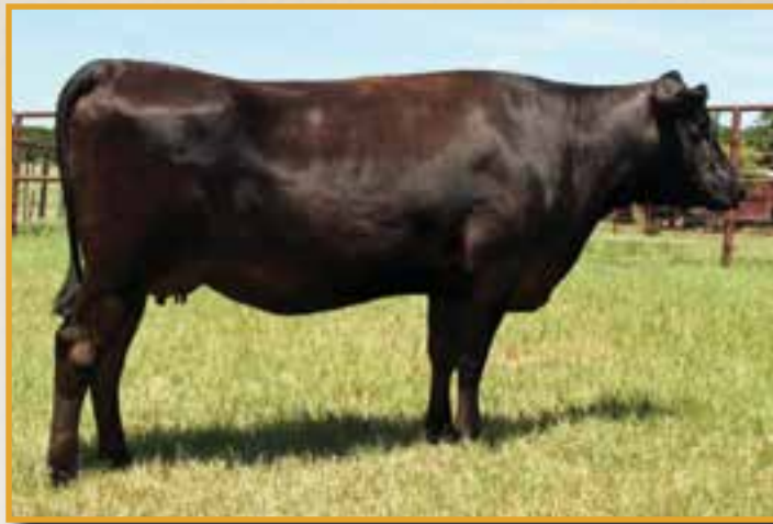
M6 MS SHIGESHIGETANI 5163 • DAM OF LOT 53.