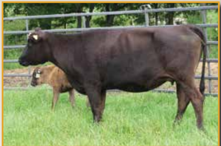
KR MS MICH 157 • SELLS AS LOT 10.