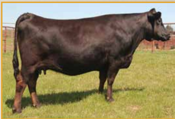
KR MS NEW LEVEL 167 • DAM OF LOTS 22-24.