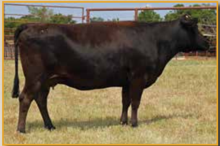
LMR MS SENSEI 2332Z • DAM OF LOT 54.