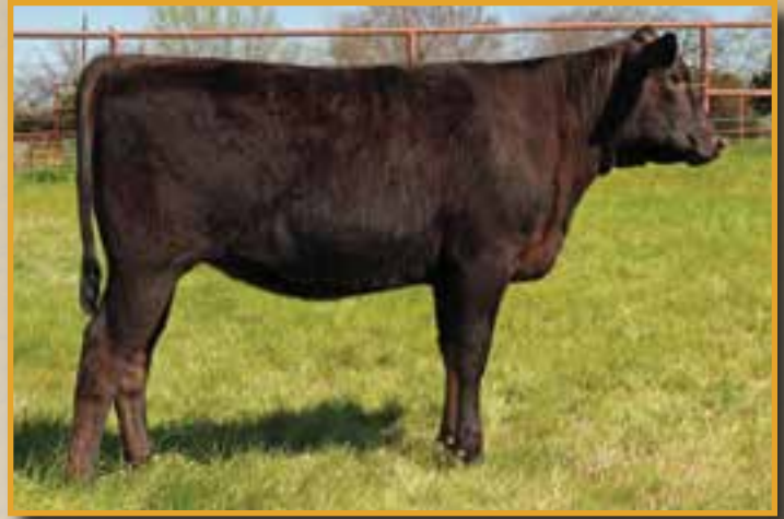
M6 MS MICHİYOSHI 904G • SELLS AS LOT 27.