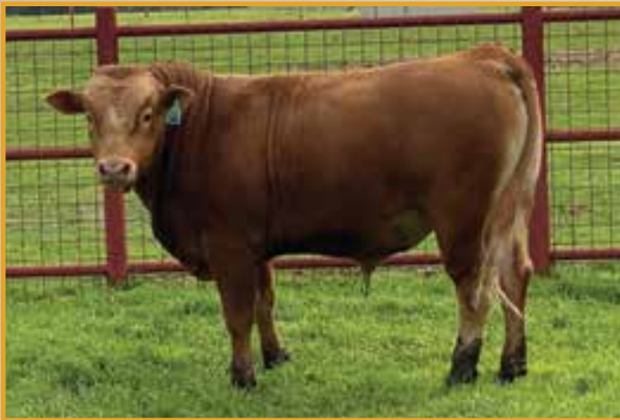
TB MR AL 144F • SELLS AS LOT 62.

Another stout addition to any herd. Sired by Big Al. Virgin bull born 8/12/2018.