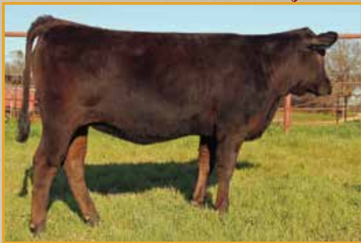
M6 MS ARIMURA 931G • SELLS AS LOT 23.

M6 Ms Arimura 931G is POLLED, powerful, and flat gorgeous. Talk about a high growth, stout-made, deep-bodied, and long-hipped female. In fact, she has the heaviest yearling weight in her contemporary group. Her dam "Miss America" 167 has produced the high selling open heifer in the 2018 M6 Sale, high selling female and bull in the 2019 M6 Sale, and a daughter was selected as Lot 1 in the 2019 TWA Sale. Her maternal cow family, Okutani, produces industry leading beef quality in addition to more pounds and milk. This is a tremendous opportunity to own a POLLED daughter of one of the industries best cows. 931G is free of all genetic disorders.