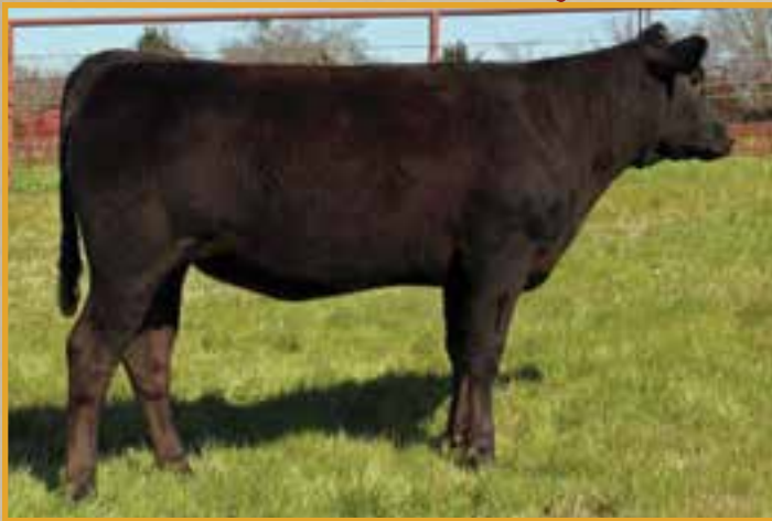
M6 MS ITOMORITAKA 920G • SELLS AS LOT 55.