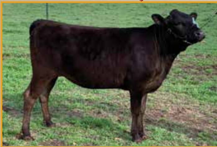
TUR SHIGESHIGETANI YAS 83F • SELLS AS LOT 20.

Pastured exposed to M6 Kitaguni 7114E bull (FB33383) from 12/01/2019 to 1/31/2020 and confirmed bred by veterinarian palpation. This bull is a son of World K's Kitaguni Jr. with TF Itomichi 1/2 and World K's Michifuku on the Dam side. Tur Shigeshigetani Yas 83F is a young heifer with pedigree for high marbling. Shigeshigetani has some of the most powerful genetics in the Wagyu breed blended together in one very impressive pedigree. Ninety % of World K's Shigeshigetani's progeny have graded a 9+ on the Australian scale, meaning 3 full grades above USDA highest grade of prime. This pedigree shows true in this heifer, and with the ultrasound-marbling scores 7.29 at 18 months, she is on her way to the same result. On the Dam side, bloodlines include Yasufuku Jr., and JVP Kikuyasu 400. Yasufuku Jr. is the #1 ranked