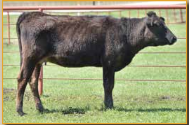
CC MS 9020G • SELLS AS LOT 48.