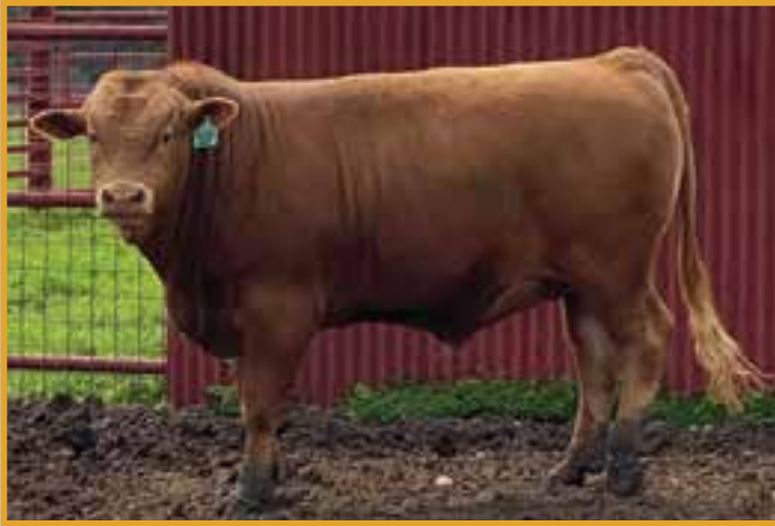
TB BIG AL JR 127F • SELLS AS LOT 61.