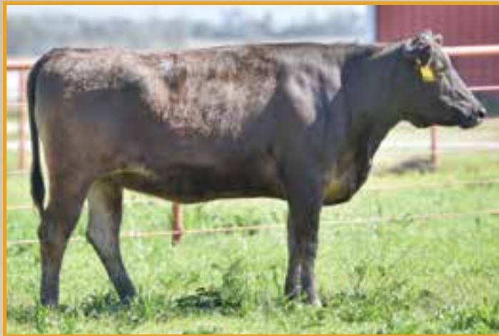
CC MS 6056D • SELLS AS LOT 31.