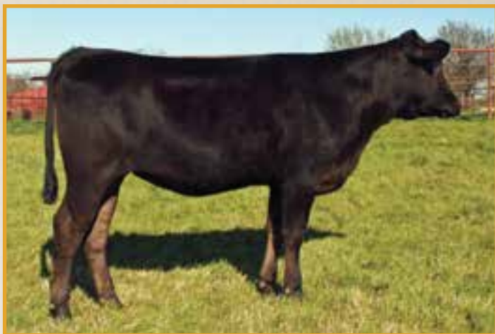
M6 MS ARIMURA 932G • SELLS AS LOT 24.

932G is a full sister to the high-selling female at the 2019 M6 Sale and the high selling open heifer at the 2018 M6 Sale. Her maternal cow line, Okutani, is well-documented for elite beef quality but they also possess extra growth and milk traits. 932G's dam, 167, is one of the most attractive, heavy milking, and powerful brood matrons in the Wagyu breed. Do not pass an opportunity to own a daughter of this great cow. 932G is free of all genetic disorders.