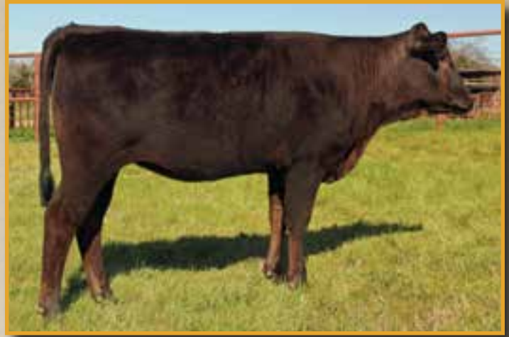
M6 MS MICHİYOSHI 922G • SELLS AS LOT 53.