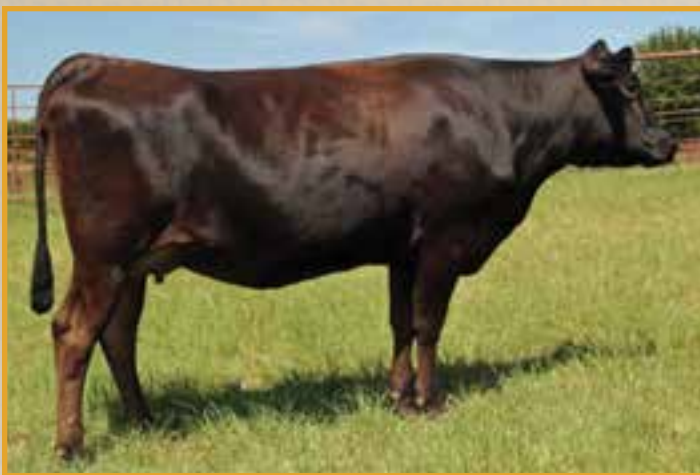
M6 MS MICHİYOSHI 709E • DAM OF LOT 55.