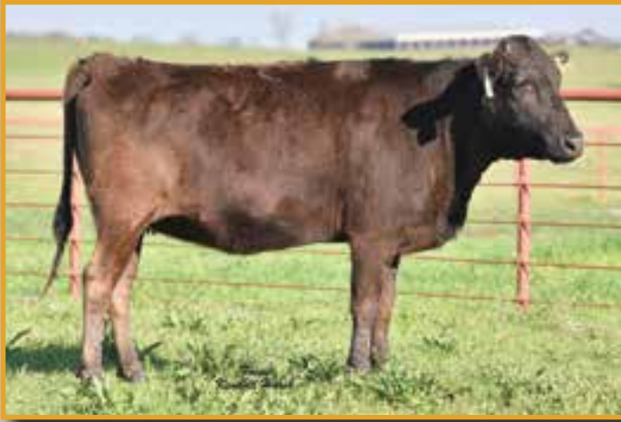
CC MS KIKUYASU 3792 • SELLS AS LOT 41.