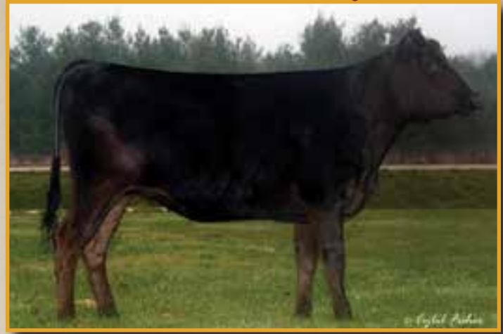
DESIGNER VOHU-ET • DAM OF LOT 201.

If you desire to get the complete and total embryos...you absolutely can get it all in this perfect example of maternal breeding. She is FB22701. A complete outcross with her Mazda sire and from the maternal side...the breed's greatest: Hisako, Hikohime and Dai 2 Kintou from the Ezokintou cow family. These maternal dams include the best of the Wagyu breed as their progeny. This donor specifically brings a double shot of Itoshigenami and for growth and milk Itomichi 1/2. She was beautifully correct and large framed cow, 1300lbs at 30 months, CHSC. She is proven USDA Prime +