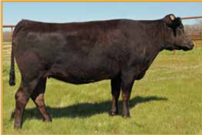
LMR MS HIRO 3442A • SELLS AS LOT 39.

LMR Ms Hiro 3442A is a heavy-milking, well-balanced, stout-made cow who shows more muscle shape throughout. She has top 10% Rib Eye genetics with impressive Growth and Milk EBVs. Her Chisahime maternal line is noted for beef quality but it also provides more Milk and Growth. 7 of the top 25 Marbling sires in the 2017 WSU National Sire Summary have the Chisahime maternal cow family. 3442A is free of all genetic disorders.