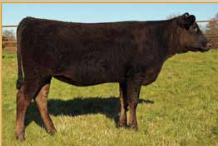
M6 MS MICHİYOSHI 8140F • SELLS AS LOT 16.