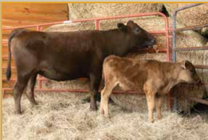
CFF C FREE'S YASUMICHI 634 • SELLS AS LOT 5.

C Free's Yasumichi CFF 634. A powerful combination of her maternal side Yasufuku whose great sire Yasufuku J930; known for his numerous qualities, including thick shoulders, large loin size, and high yield rate. Yasufuku J930 is regarded by Kenichi Ono as perhaps the greatest of all Wagyu Sires. Sired by C Free's Top Shelf (FB13433) ultrasound scan: Ribeye area of 12.3, IMF-03.61, making him large frame, heavy muscle bull that is producing exceptional offspring with good milking abilities, and calves with high SCD/Tenderness scores. Cow tests free of all genetic defects, scored a 7 in tenderness, AA in SCD, and has a 5% inbreeding coefficient. Cow is bred back to FB30189-AA/9, and has a bull calf CFF983 at side that scored 9 on Tenderness, AA in SCD, this amazing being her FIRST calf!