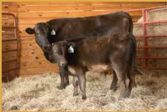
CFF C FREE'S SHIGESHIGETANI 633 • SELLS AS LOT 4.