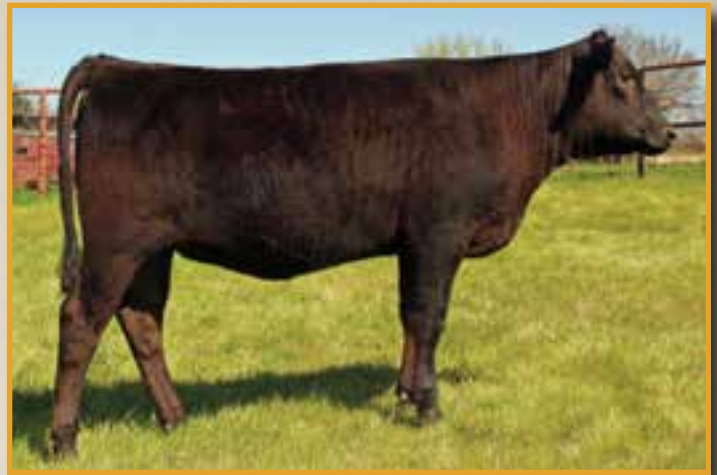
M6 MS MICHİYOSHI 908G • SELLS AS LOT 28.