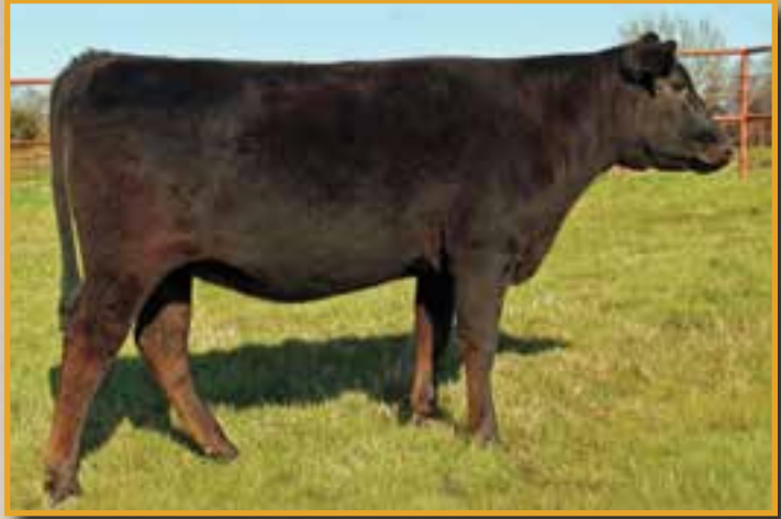
M6 MS SHIGESHIGETANI 8130F • SELLS AS LOT 13.