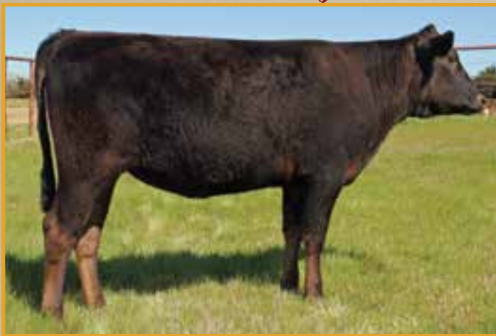
M6 MS HIRASHIGETAYASU 877F • SELLS AS LOT 11.