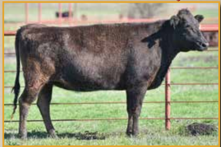
TBR HIKOFUJINAMI 7-1 4030A • SELLS AS LOT 33.

AI Bred 12/9/19 to Shigeshigetani, PE to FB21194. CHCS The bottom side of this pedigree features both Itoshigefuji (TF147) and Itoshigenami (TF 148). This combination is proving to be a top line for carcass traits.