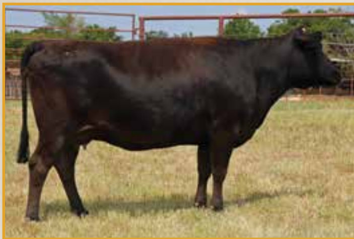
LMR MS SENSEI 2332Z • DAM OF LOT 52.