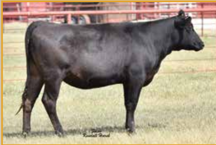
L7 MS YOSAN 11Z • SELLS AS LOT 42.

AI Bred 12/9/19 to Michifuku, PE to FB21194 BW 61, WW 504