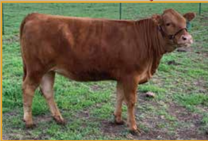
TUR LITTLE RED MOON 88F • SELLS AS LOT 45.

A heifer who completed in this year's Houston Livestock Show and finished 3rd overall in red heifer division. On the sire side, this heifer has Rueshaw and Umemaru, two of the most famous bulls in the industry. On the dam side, the heifer comes from Kalanga Red Star and Shigemaru and has a long history of Champions. The dam of this heifer won Grand Champion of the 2014 Houston Livestock Show and the dam's sister won Grand Champion at the 2012 Houston Livestock Show and went on to sell for $44,000 at the Steaks are High Sale. If you are looking for a heifer with a great pedigree and championship credentials, then this is your heifer. This heifer is located in the Texas Hill Country with many shipping options available.