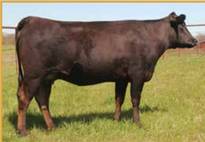
KR MS HIRASHIGE 205 • DAM OF LOTS 25-28.