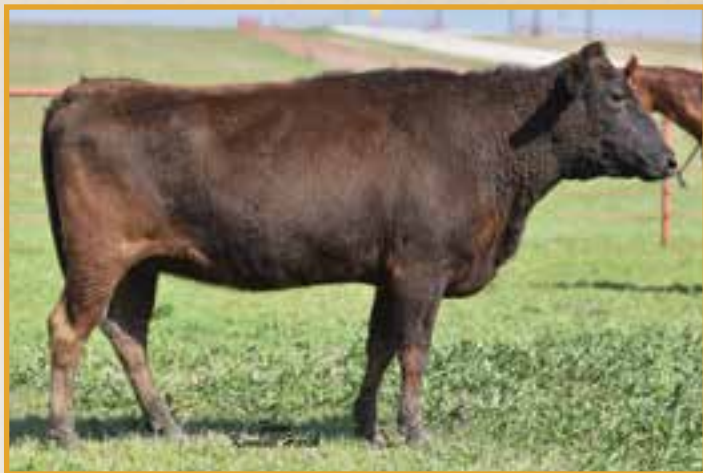
CC MS KITAGUNI 3800 • SELLS AS LOT 40.

Kitaguni Jr daughters are in great demand right now and there is no question why. Just like this female, they are larger cattle and very long bodied. In addition, Kitaguni Jr is known for very high marbling around the world.