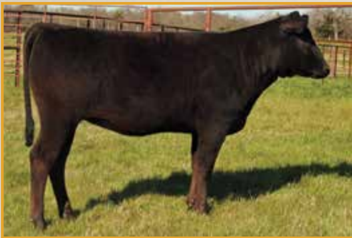
M6 MS SANJIROU 943G • SELLS AS LOT 52.