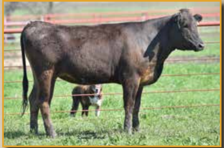
CC MS 7000E • SELLS AS LOT 17.

7000E is sired by what is considered the Best bull ever raised by Triangle B Ranch, Stigler, OK. He goes back to a line bred TF 148 Itoshigenami daughter 035X and is sired by Kikutsuru Doi 146. A full sister to 4051A sold in our production sale in 2017 for $50,000. This is a very Rare pedigree outside of Japan. 7000E Was AI Bred to Sanjiro 12/9/19 and PE to FB21194. BW 55, WW 468