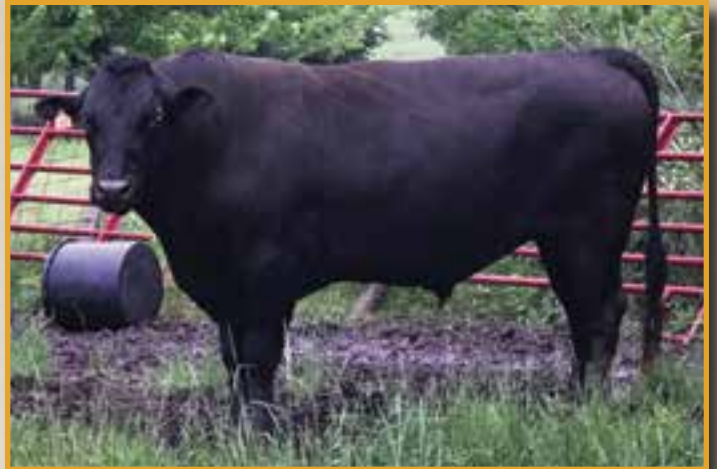
FIVE STAR RANCH #34 • SELLS AS LOT 65.