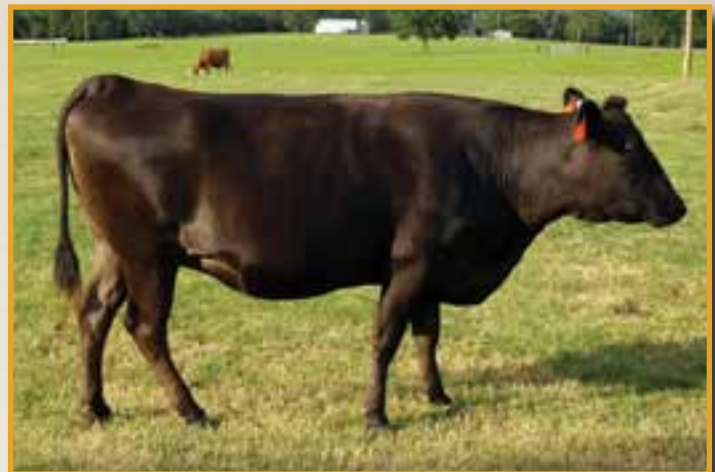
BLB MS KUIHO 1206 • DAM OF LOT 202.

Kitaguni Jr FB2422 x BLB Ms Kuiho FB13382 (B3C) IVF- female sorted semen. Kuiho is a daughter of Michifuku and on the maternal side, outstanding JVP breeding with Kikuyasu 400 grandsire and JVP Yasutanisakura as 2nd sire, who is out of Yasukane.