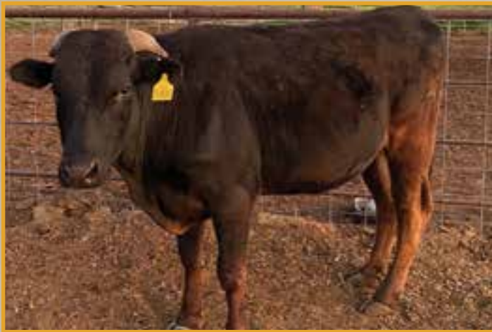
SELLS AS LOT 67.