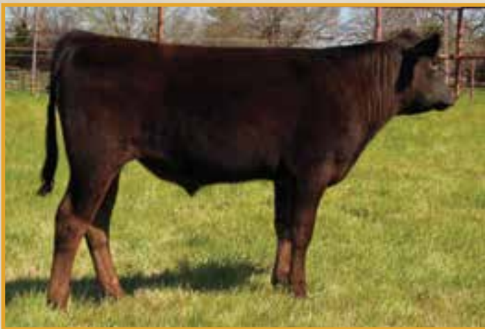
M6 PRELUDE PLD 968G • SELLS AS LOT 2.