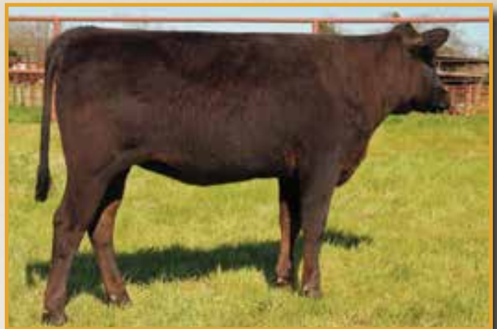
M6 MS SANJIROU 937G • SELLS AS LOT 54.