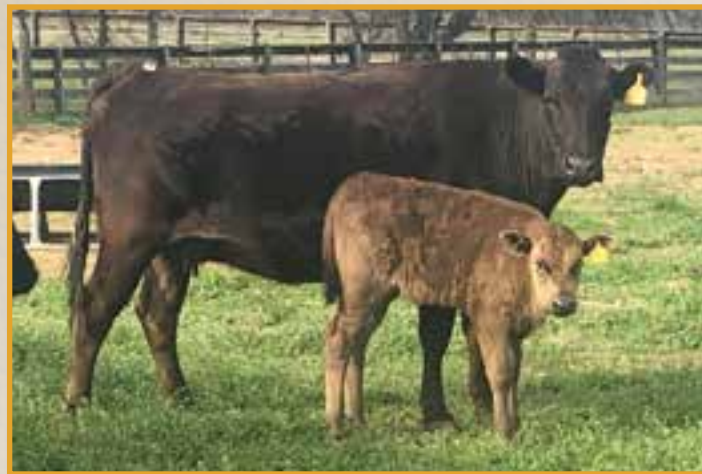
LAR MS MICH • DAM OF LOT 214.

Embryos are stored at Kay Ranch and are not eligible for export.