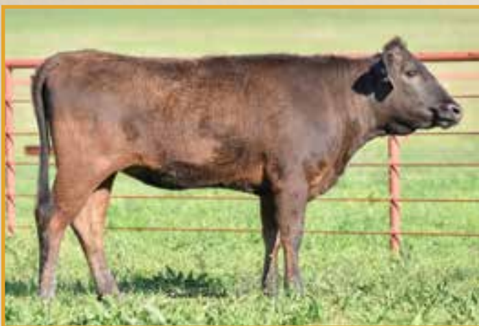
CC MS 9018G ET • SELLS AS LOT 47.