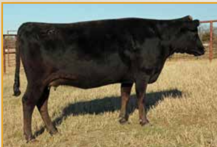
LMR MS ITOMICHI 1/2 1292Y • DAM OF LOT 16.