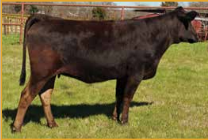
M6 MS SANJIROU 7104E • SELLS AS LOT 25.