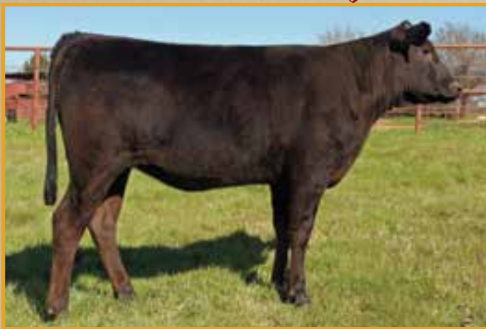
M6 MS MICHİYOSHI 950G • SELLS AS LOT 51.