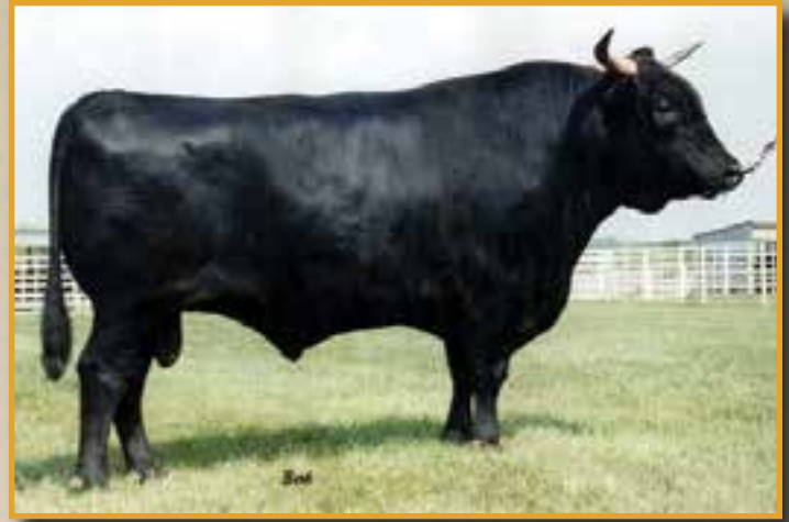
IF ITOMICHI 1-2

TF Itomichi 1/2 comes from the famed Takeda Farms breeding program. I have been impressed with the docility, muscularity and structure TF Itomichi 1-2 has put in his progeny. I estimate his full blood pedigree to be 13% Tajima, 2% Kedaka, 0% Tuttori, 0% Itozakura, 85% Shimane, 0% Okayama and 0% other. This lot is 15 straws of semen stored at Agrimark Genetics in Kingsbury, Texas.