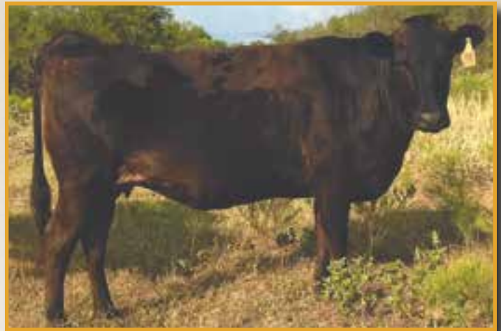
UFR SHEZA TF KIKUHANA 50D • SELLS AS LOT 29.

She is a 4-year old cow entering into the most productive years of her life. 50D is sired by TF Kikuhana who ranks in the top 5% of breed plan for milk and the top 10% for 600 lb. weight. Kikuhana is a line DIA 7 Itozakura who is one of the most famous bulls of the Shimane prefecture and dominates pedigrees in Japan. 50D is out of Clear Creek Cattle Company outstanding donor cow CHR Ms Itoshigenami 2647 (TF148) a carrier free cow that has produced many embryos and show quality animals. 264T is by one of the 3 best marbling and carcass producers in the Wagyu breed Itoshigenami. She is free of all genetic disorders. Calf is sired FB27280, UFR Mr San 4 66E.