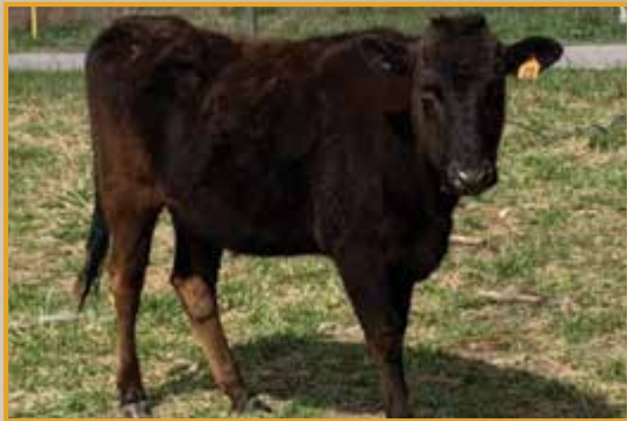
ABE MS KOUSYUN 21F • SELLS AS LOT 38.

Ms Kousyun is showing the frame and growth of her dam. She is confirmed bred to our heavy Kedaka/Tottori line bull Tatuso FB40811. This is the kind of pairing you see throughout the Kyushu region in Japan. In fact, the 2012 Zenkyo carcass winner came from Nagasaki and the breeding was Kedaka x Yasufuku x Kedaka. This is great opportunity to get both Yasufuku genetics and a calf that will have great balance of carcass performance and improved maternal abilities. Shipping responsibility of the buyer. Located in Carson, VA