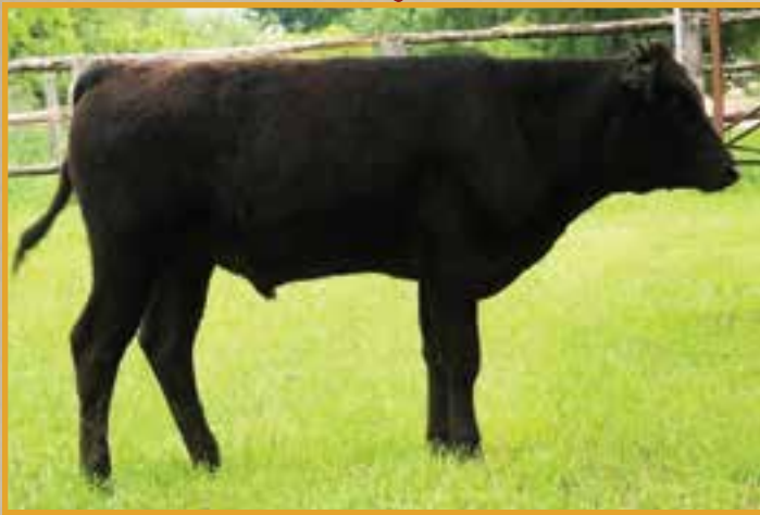
RGR RANGER G436 ET • SELLS AS LOT 1.