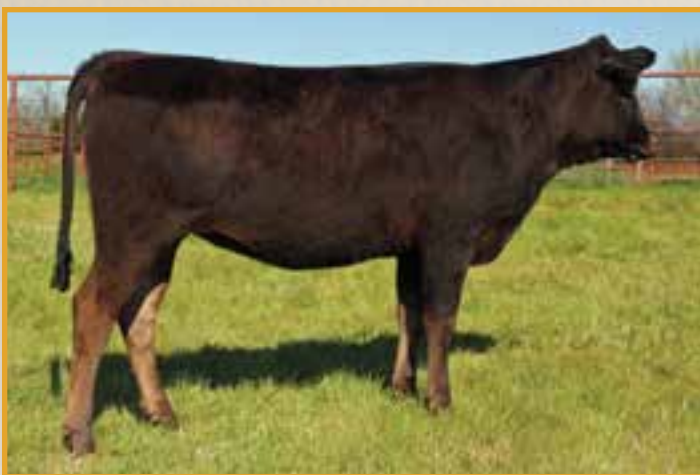
M6 MS MICHİYOSHI 947G • SELLS AS LOT 56.