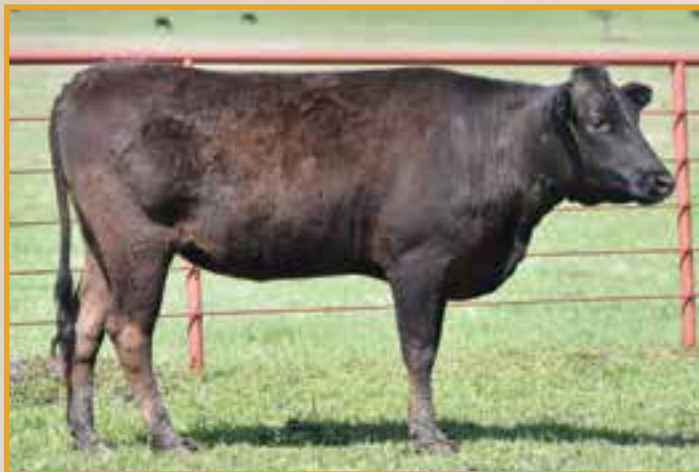
CC MS ITOMORITANI 5045 • SELLS AS LOT 32.

This big bodied female will prove to be very maternal. She is sired by Itomoritaka J2703, who is known for added growth and high quality Marbling, combined with maternal traits siring some of the heaviest milking daughters in the breed.