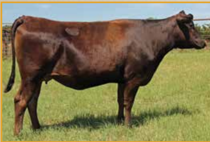
M6 MS SHIGESHIGETANI 708E • DAM OF LOT 51.