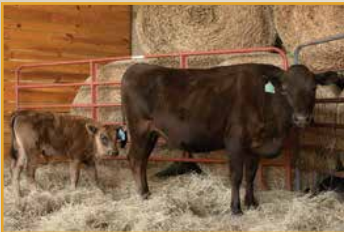
C FREE'S HARUKITAYASU CFF520 • SELLS AS LOT 6.