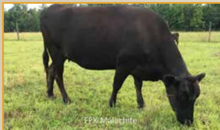
FFX MALACHITE • DAM OF LOTS 219, 220.

Dam – FB12899 HW Dai Nami Doi 28x. We bought our 1st female, FFX Malachite because of 28x. We have been so happy with Malachite, when