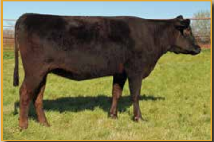
M6 MS HIRASHIGETAYASU 758E • SELLS AS LOT 43.