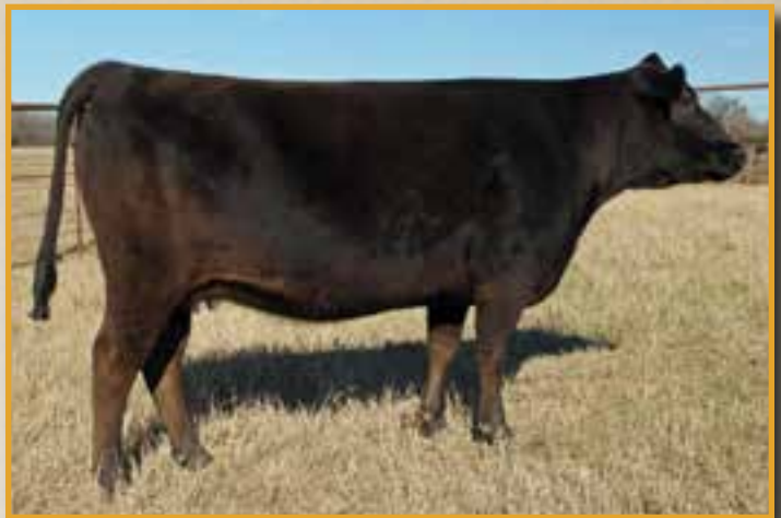
CC MS HIRAMICHIBAR 1 2719 • DAM OF LOT 44.