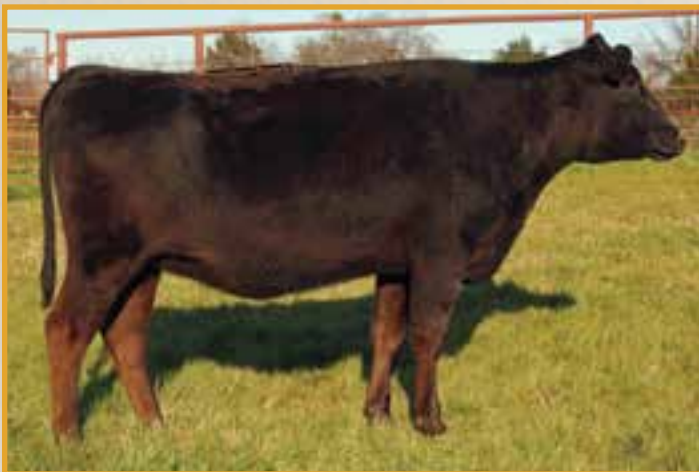
M6 MS SHIGESHIGETANI 7103E • SELLS AS LOT 37.