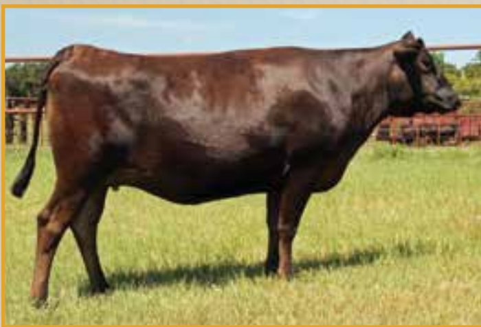
M6 MS MICHİYOSHI 604D • DAM OF LOT 11.