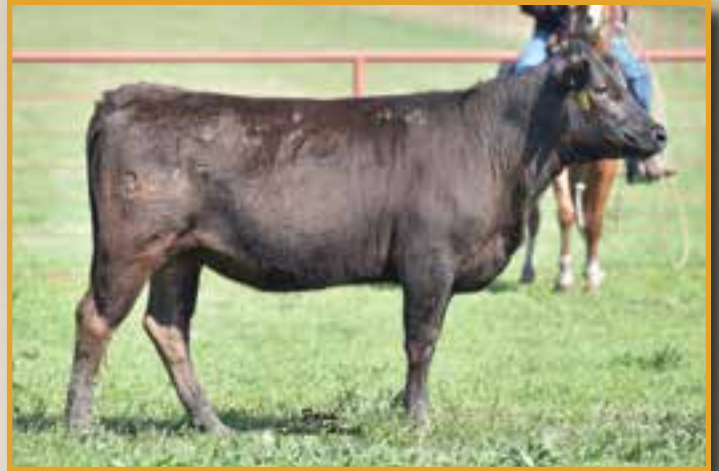
$XXXX CC MS 7050E • SELLS AS LOT 18.

Sired by one of only three direct descendants of what is considered by many as the best Wagyu bull in Japan, Yasufuku J930, her sire Kousyun is proving to outperform Yasufuku JR in growth and performance, yet pass the same excellent carcass traits. AI 12/9/2019, PE FB21194 BW 60, WW 416