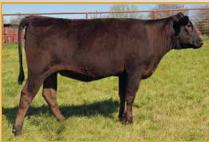
M6 MS SHIGESHIGETANI 910G • SELLS AS LOT 12.