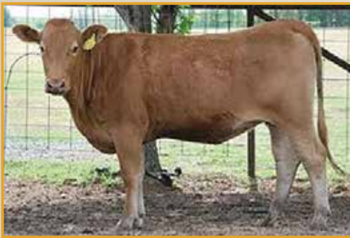
ROWE MS RED STAR • DAM OF LOTS 206-208.

All semen and embryo lots will sell in a timed auction hosted by SmartAuctions.