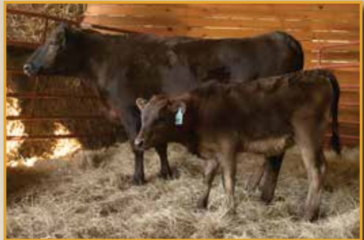
CX4 MS HIROSHIGE 109Z • SELLS AS LOT 9.

3 IN 1!!! LAR 2001 has great meat quality, large ribeye area, thick rib area, and outstanding on milk product. She's an outstanding Female with top-notch makers for marbling. LAR 2001 last 3 offspring's all scored a "Tenderness of 10" (CFF981G/U50214, CFF865G/FB42569, CFF750F/FB33938). This cow is free of all genetic defects, tenderness of 7 SCD-VA. Cow is bred back to FB30189-AA/9, and has an AA/10 bull calf CFF981G at side. Paternal side, Great Grandsire of this cow is Sanjiro. He is one of the most influential sires of the Tajima line. He is in the top 10 in marbling and ribeye. Sanjiro daughters are treasured across the land and to own a double bred Suzutani just increases the value. On her Dams side you have Kikuasu-400 (FB2100), known for producing top carcasses, big ribeye and tall cattle.