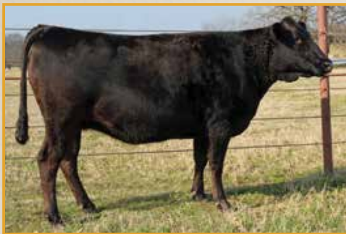
M6 MS MICHİYOSHI 616D • DAM OF LOT 12.