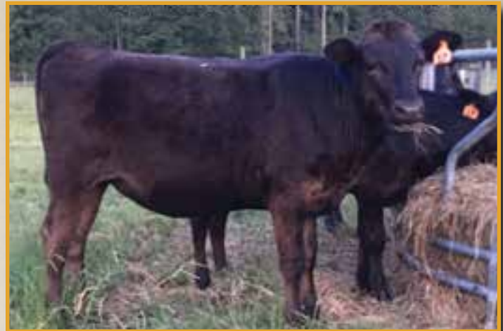
ABE MS ITZURU DOI 17F • DAM OF LOT 221.