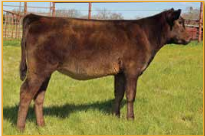
M6 MS PRELUDE 9123G • SELLS AS LOT 14.

100% BLACK, HORNED, Fullblood Cow Birth Date: 10/16/2019 Reg. No. FB49739 Consignor: M6 RANCH