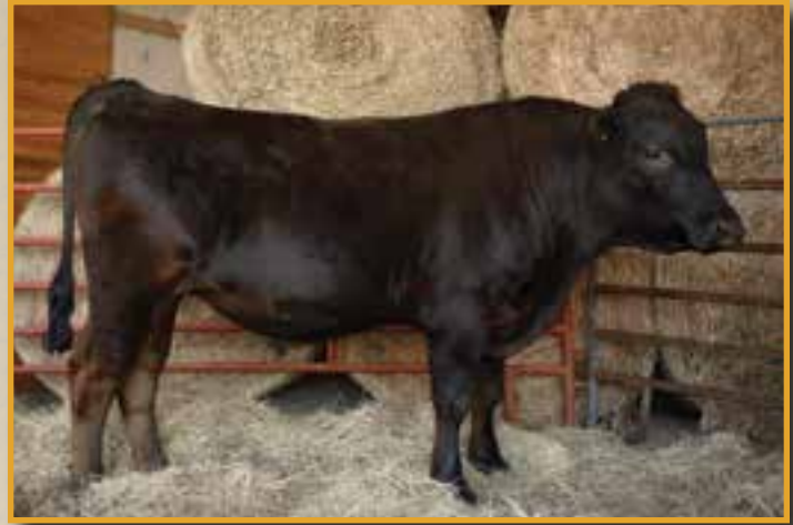
KR E236 • SELLS AS LOT 57.

KR E236 is a power house!! Exactly what breeders are looking for to increase marbling and size in their cattle herd! E236 tests free of all genetic defects, scored a 9 on Tenderness, AA in SCD, and has a 1% inbreeding coefficient. Producing offspring's with high marbling and tenderness scores (CFF981G, CFF983G, and CFF978G). While at the Genetic Development Center E236 at 15 months weighed in at 1192 lbs. and currently weighs over 1600 lbs. Outstanding composite of some of the industry's leading foundation sires: World K's Kitaguni, Kikuhana, JVP Fukutsuru-068, Itomichi 1/2, Kedaka, Kitateruyasu Doi J2810, and Hirashigetayasu.