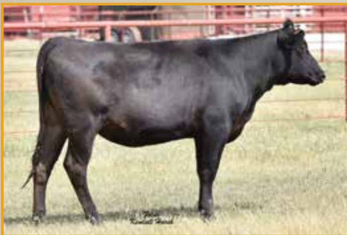
CC MS 9015G ET • SELLS AS LOT 46.

Sells Open Not yet registered + high strung in video