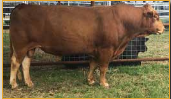
SOR BIG AL • SIRE OF LOT 208.

4 Female sexed, grade 1, conventionally collected embryos SOR Big Al is a very long bodies Akaushi bull and was the high selling bull at the 2017 TWA Wagyu Sale. Rowe Ms Red Star is a full sister to Red galaxy and is a beautiful example of what you would want in an Akaushi cow. She is a prolific producer of embryos. These embryos should produce some fantastic Akaushi cows. Both dam and sire in this embryo mating are genetic defect free.