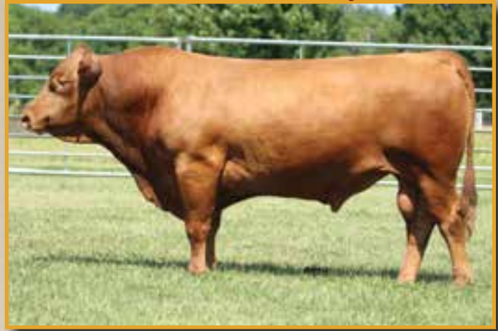
JC RUESHAW 92 • SIRE OF LOT 207.

4 Female sexed, grade 1, conventional embryos. JC Rueshaw 92 is regarded as an outstanding bull. His sire was a Japanese National Champion and his dam was sired by Umemaru. Umemaru is a combination of Hikari and Kaedemaru. We have three heifers out of 92 on our farm. Rowe Ms Red Star is a full sister to Red Galaxy and a beautiful example of what you would want in an Akaushi cow. She is also a prolific producer of embryos. Both dam and sire in this embryos combination are genetic defect free.