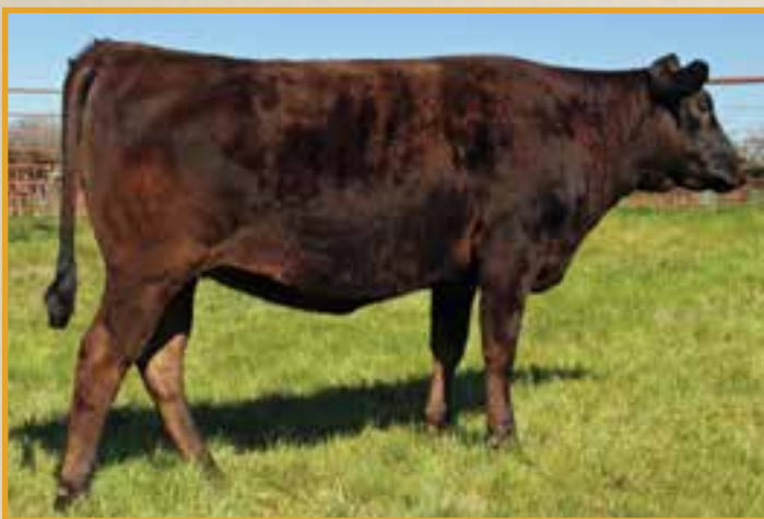
M6 MS MICHİYOSHI 862F • SELLS AS LOT 22.