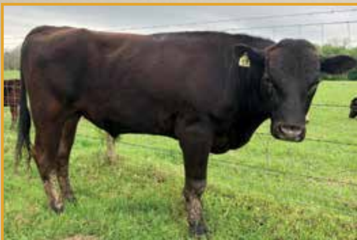
LRX KENHANAFUJI 0319F-10F • SELLS AS LOT 68.

SIRE HIRASHIGETAYASU J2351 DAI 20 HIRASHIGE 287 DAI 5 YURUHIME DAM HP MS SHIGESHIGEHANA 50 WORLD K'S SHIGESHIGETANI HR MS KIKUHANA 13 SCD: TEND: