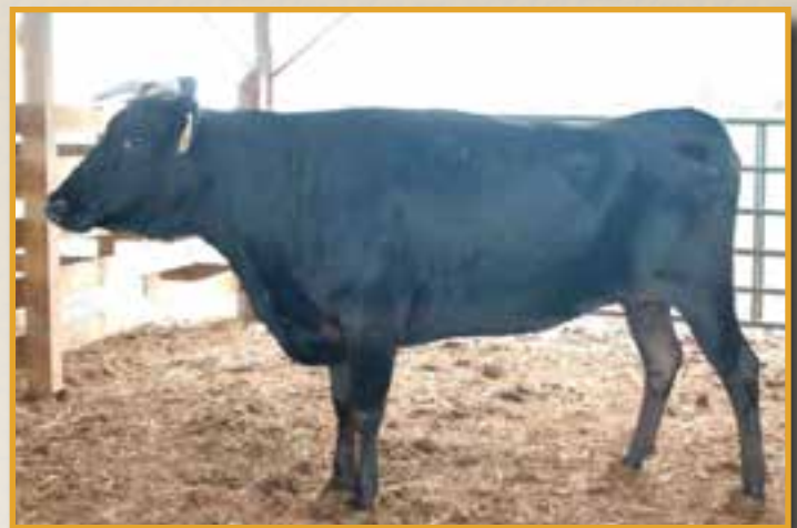
HW DAI NAMI DOI 28X • DAM OF LOTS 217, 218.