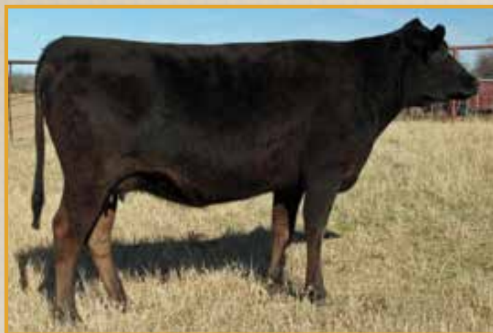
M6 MS FUKUTSURU 466 • DAM OF LOTS 35-37.