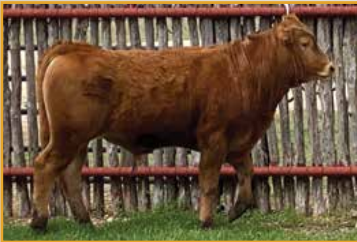
TB BIG SHIG 110G • SELLS AS LOT 63.

Virgin calf bull born 8/24/2019. He is the brother of TB Big Al Jr. 127F (FB43908) and is sure to grow into a strong bull