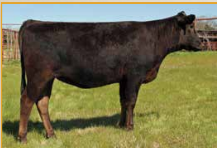
M6 MS MICHİYOSHI 8123F • SELLS AS LOT 26.