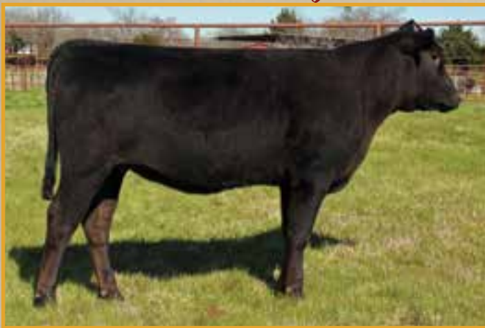
M6 MS AKAHIGE 902G • SELLS AS LOT 15.