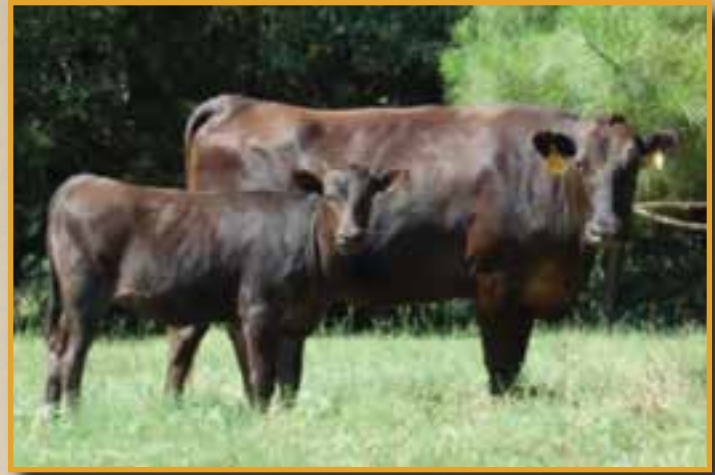
JVP HIRATAFUJI 402 • SIRE OF LOT 220.

Rare genetics paired with a great cow. Female sexed embryos. Sire – FB2116 JVP Hiratafuji 402 - Here is one of the few 100% Ito bulls available. Hiratafuji traces 3 times back to Dai 7. Per UKB, Hiratafuji produces daughters who are superior mothers. They have excellent frame sizes, great milk production and are very docile. Hiratafuji sons and grandsons have had some of the best yields and quality grades we have ever seen. Whether you are producing beef or genetics, Hiratafuji can do wonderful things for overall herd improvement and offspring quality. Dam – FB19542 FFX Malachite - Malachite is a well-bred, nicely put together Wagyu cow. She is smooth boned, medium build and roughly 1,150 lbs. Malachite has been paired with larger framed sires to add back frame & milk. Like her dam, 28X and Grandam, the TF151 daughter Hiratanachi, Malachite is very fertile and a magnificent flusher. We expect that fertility to pass down to her offspring. We have been pleased with all of her offspring so far and will have carcass data in 2020. We expect this to be a wonderful pairing. 5 Grade 1 IVF reverse sorted female sexed embryos. Will guarantee 2 pregnancies if implanted by a certified embryologist. Domestic. Shipping is buyer's responsibility. Located at Trans Ova Maryland. Carrier Free by Pedigree.