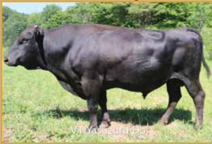
VT YASUZURU DOI • SIRE OF LOT 218.

the opportunity to acquire 28x happened, we jumped at it with 2 partners. 28x has everything you want in a maternal line; growth, milk, & excellent carcass quality. Just take a look at her lineage: TF 728, Itozuru Doi, Fujiko, & Okutani. 28x is large, long, smooth boned, and a good pairing with VT Yasuzuru Doi.